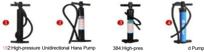
1: High-pressure Unidirectional Hana Pump 2: High-pressure Unidirectional Hana Pump 3: High-pressure Unidirectional Hana Pump 4: High-pressure Unidirectional Hana Pump