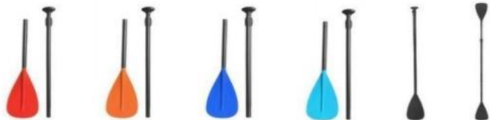
Unidirectional & Bidirectional Paddles [Paddle color can be customized upon request]