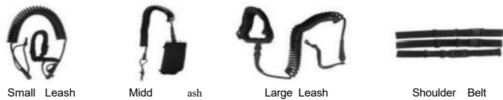
Small Leash Middle Leash Large Leash Shoulder Belt